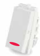
6A One Way with Indicator

Rated Voltage: 230V Rated Current: 6A and 16A Frequency : 50Hz AC Module: 1 Terminal Capacity: 6A-1.5 Sq mm, 16A-4 Sq mm