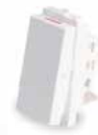
16A One Way Switch