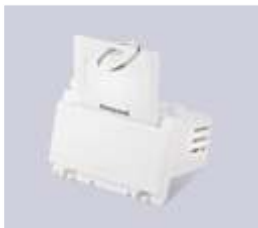
DW527WHI/BLK 20A Energy Key Switch with Time Delay