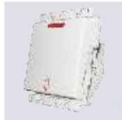
DW504WHI 2M Bell Push Switch