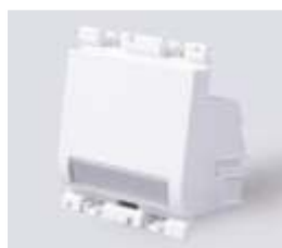
DW530WHI Down Light