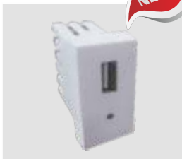
DW583WHI USB Charger

Module : 1M Features : ♦ Inbuilt surge protection ♦ Short circuit protection available in output ♦ Snapfit modular design Application : Charging devices with a USB connection like smart phones, touch screen tablets, games consoles, MP3 players, E-book readers, Cameras, Navigation devices, etc. Specification Details Input Voltage : 90V to 270V Frequency : 50Hz Input Power : 300mW [With No Load] Output Voltage : 4.75V [Without Load] to 5.16V [Full Load] Output Current : 0 - 1 Amp Output Power : 0 - 5 Watt Output Over Current Protection : 1 - 1.2 Amp Output Rise Time with Load : 76mS @210V