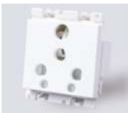
DW428WHI 10/25A Socket

Module : 2M Elec.Spec. : Rated Voltage - 250V, Rated Current - 6/10/13A, Nature of Supply - AC only, Terminal Capacity - 2.5 Sq.mm Features : ♦ Patented drop down safety shutters in international socket makes it probably the safest in its class which refuses single pin access to line and neutral contacts ♦ Truly international; compatible to plug tops of over 17 countries ♦ Inbuilt safety shutters ♦ Contact terminals -Phosphor Bronze ♦ Fully RoHS compliant product Dimension : H - 45 mm, W - 50 mm Colours : Satin White / Charcoal Black