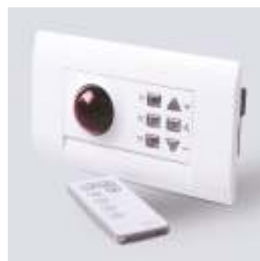
DW606WHI Remote Switch