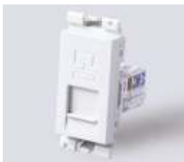
DW493WHI CAT 6 RJ 45

Module : 1M Elec. Spec. : No of contacts - 8, Category - Cat 6, Speed of transmission - 250 MHz 100 Ohms UTP cable size, Rate of transmission - 1 GB/sec, Compliance of standards - FCC Part 68, Insulation resistance - >500 M Ohms, Current rating - 150 VAC, 2 A, Dielectric withstand voltage - 1000V, 60 Hz/1min, Contact resistance - <20 million Ohm, DC Resistance - 0.1 Ohm Features : ♦ CAT 6 compliant Rj45 ♦ Spring loaded sliding shutter that protects from dust ♦ Underwriters Laboratories (UL) approved ♦ Tool free connecting terminals ♦ 50µ" Gold plated leads for better data transfer efficiency ♦ Fully RoHS compliant product Dimension : H - 45 mm, W - 25 mm Colours : Satin White / Charcoal Black