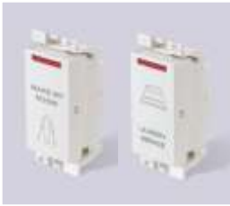
DW416WHI/BLK/ DW415WHI/BLK 1M MML/MMR Switch

Module : 1M Features : ♦ Modular (1M) ♦ Laser marking on the switch rocker ♦ LED lamp for use as locator or indicator ♦ LED ensures less consumption of electricity and long life ♦ Rocker shape for more ergonomics, human touch and feel ♦ Easy installation/ removal of module due to the snap fit feature ♦ LED for long life Application : Service indication in hotel industry Dimension : LxB:44.9x24.7 mm Depth:26mm