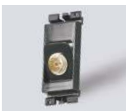
DW451BLK TV Socket

Module : 1M Features : ♦ Angled connector holding ♦ Silver plated for minimal signal loss ♦ Screw terminals for easy installation ♦ Fully RoHS compliant product Dimension : H - 45 mm, W - 25 mm Colours : Satin White / Charcoal Black