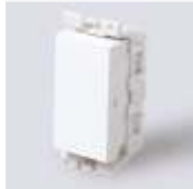
DW501WHI 6 AX One Way Switch

The Blenze plus switches are completely flush with the front plate in 'off' condition making them appear flat on the wall. They have a shroudless rocker with positive action. The range is future proofed 10AX and is IP 20 rated, making it truly a next generation switch range. The switches are designed with RH base for easy installation. Blenze plus range of switches are engineered with ant ingress design which give complete protection from ant entry. The 32A DP switch is definitely the 'best in class'. It can carry heavy resistive and inductive loads up to 7.68 kW. Also, in the switch, the lenses are textured for better visibility of indicators. All this and more reaffirm Honeywell's leadership in switch technology.