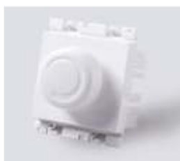
DW480WHI Push ON/OFF 400 W Dimmer

Module : 2M Elec. Spec. : Rated Voltage - 230V, Rated Power - 400W, Nature of Supply - AC only, Type of load - Incandescent lamp only, Terminal capacity - 2.5 Sq.mm on pre marked screw-connector Features : ♦ Push ON/OFF knob ♦ Convenience of switching at any dimming-level ♦ Ease of installation with pre-marked screw-connector ♦ Full 400W power handling capability ♦ Linear brightness control ♦ Fully RoHS compliant product Dimension : H - 45 mm, W - 50 mm Colours : Satin White / Charcoal Black