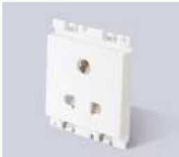
DW420WHI 10A 2/3 Pin Universal Socket

Blenze plus sockets are engineered to ensure easy and absolute engagement to plug top. They have an enhanced safety feature of a smart anti single pin entry shutter. All sockets are rated to minimum 10A for future-proofing. The shutter design ensures that the Earth pin of the plug is engaged first before Line and Neutral pins in case of 3pin plug. All contact points are made of Phosphor Bronze material that is corrosion resistant ensuring long term reliability and avoids loss of electrical energy. All sockets are available in 2 modules.