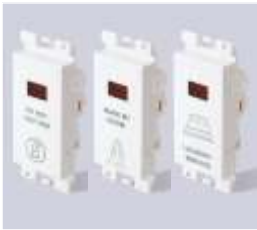
D901WHI/BLK/ DW902WHI/BLK/ DW903WHI/BLK 1M DND, MMR, MML Indicator

Module : 1M Elec. Spec. : Rated - 100 Ohms 3W LIN w/w, Amplifier audio input (max) - 17V - RMS (35W RMS in 8 Ohms) | Terminal capacities - flexible leads with connectors Features : ♦ Modular (1M) ♦ Comes in compact single module size ♦ Good visibility of the service ♦ LED for long life Application : Service indication in hotel industry Dimension : LxB:44.9x24.7 mm Depth:24.4mm