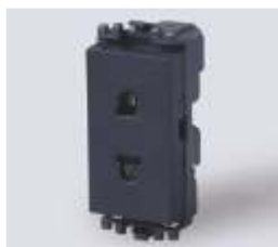
DW427BLK One Module 2 Pin Charger Socket

Module : 2M Elec. Spec. : Rated Voltage - 230V, Rated Current - 10/25A, Nature of Supply - AC only, Terminal capacity - 4 Sq.mm Features : ♦ Ensures a perfect fit with any 3 pin plug tops ♦ Inbuilt safety shutters ♦ Contact terminals - Brass ♦ Designed to the requirements of IS 1293:2005 ♦ Fully RoHS compliant product Dimension : H - 45 mm, W - 50 mm Colours : Satin White / Charcoal Black