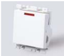
DW224WHI 32A DP Switch