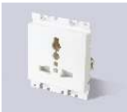
DW426WHI 6/10/13A International Socket

Module : 2M Elec.Spec. : Rated Voltage - 250V, Rated Current - 10A, Nature of Supply - AC only, Terminal Capacity - 1.5 Sq.mm Features : ♦ 10A 2/3 pin shutter socket is India's first fully compatible socket for both 4mm and 5mm dia pins ♦ 3 pin socket can take mobile charger too w Safety shutters ♦ Contact terminals - Phosphor Bronze ♦ Designed to the requirements of IS 1293:2005 ♦ Fully RoHS compliant product Dimension : H - 45 mm, W - 50 mm Colours : Satin White / Charcoal Black