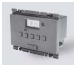
DW219BLK Timer Switch