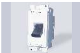
DW227WHI 25A Minitrip Switch