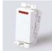
DW403WHI 10 AX One Way Switch with Indicator