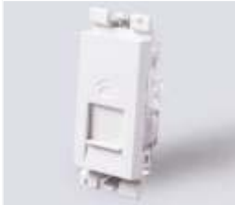
DW492WHI Two Line RJ 11

Module : 1M Elec. Spec. : No of contacts - 4, Category - 3, Voltage - 33V r.m.s / 70V DC, Speed of transmission - 16 MHz 100 Ohms UTP cable size, Rate of transmission - 10 Mbps, Compliance of standards - FCC Part 68, ANSI/EIA/TIA-568 TIA TSB - 36, TIA TSB-40, Attenuation - 0.4db Features : ♦ 2 Lines can be connected simultaneously ♦ Anti-spread (Strands) Screw terminals for easy installation ♦ Spring loaded sliding shutter that protect from dust ♦ 50µ" Gold plated leads for better data transfer efficiency w Fully RoHS compliant product Dimension : H - 45 mm, W - 25 mm Colours : Satin White / Charcoal Black