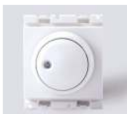
DW472WHI Step Fan Speed Control 120W

Module : 2M Elec. Spec. : Rated - 100 Ohms 3W LIN w/w, Amplifier audio input (max) - 17V - RMS (35W RMS in 8 Ohms), Terminal capacities - flexible leads with connectors Features : ♦ Five definite speeds + OFF ♦ Unique knob with SPEED - VIEW™ ♦ Completely hum-free irrespective of speed ♦ Uniform speed increments across steps ♦ Ease of installation with pre-marked screw-connector ♦ Fully RoHS compliant product Dimension : H - 45 mm, W - 50 mm Colours : Satin White / Charcoal Black