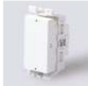
DW502WHI 6 AX Two Way Switch