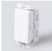
DW405WHI 10 AX Bell Push Switch