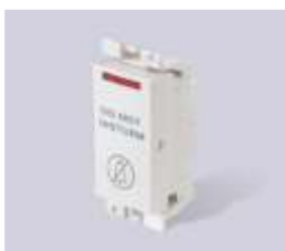
DW414WHI/BLK 2 way Switch DND marked 1M