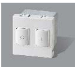
DW217WHI 25A AC Motor Starter